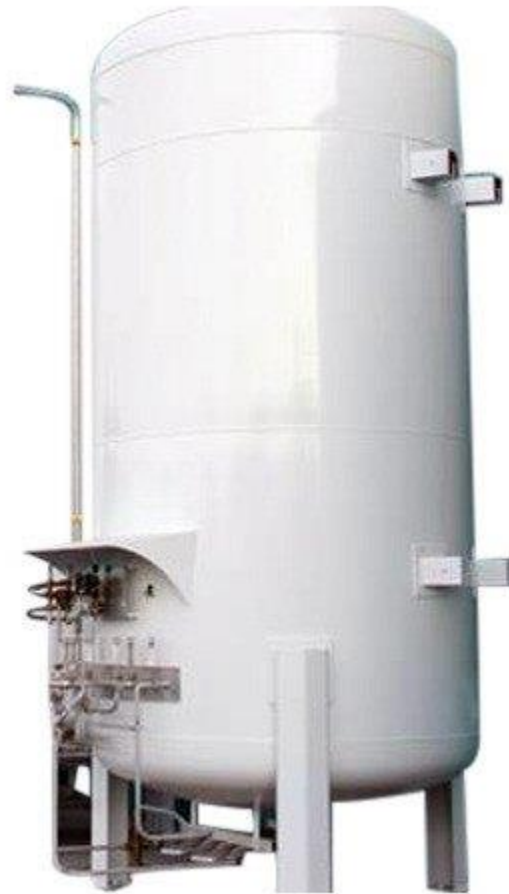
LIQUID OXYGEN Storage Vessel – 20000 L