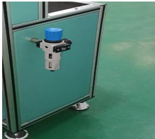
Fig: Air Drive Pressure Regulator

I. Drive air regulator: - We can control drive air pressure using below shown regulator by rotating it clock wise pressure will increase & we can decrease pressure by rotating it anticlockwise direction.